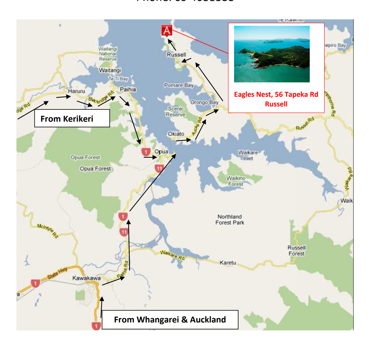
If using a GPS unit, please ensure you allow "routes using ferries"