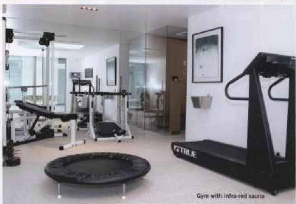
Gym with infra-red sauna