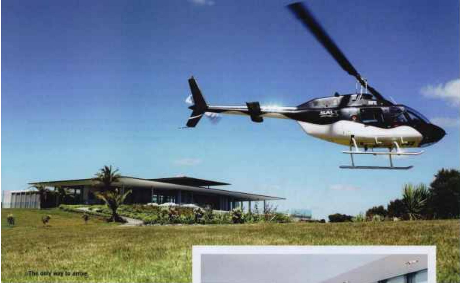
The only way to arrive